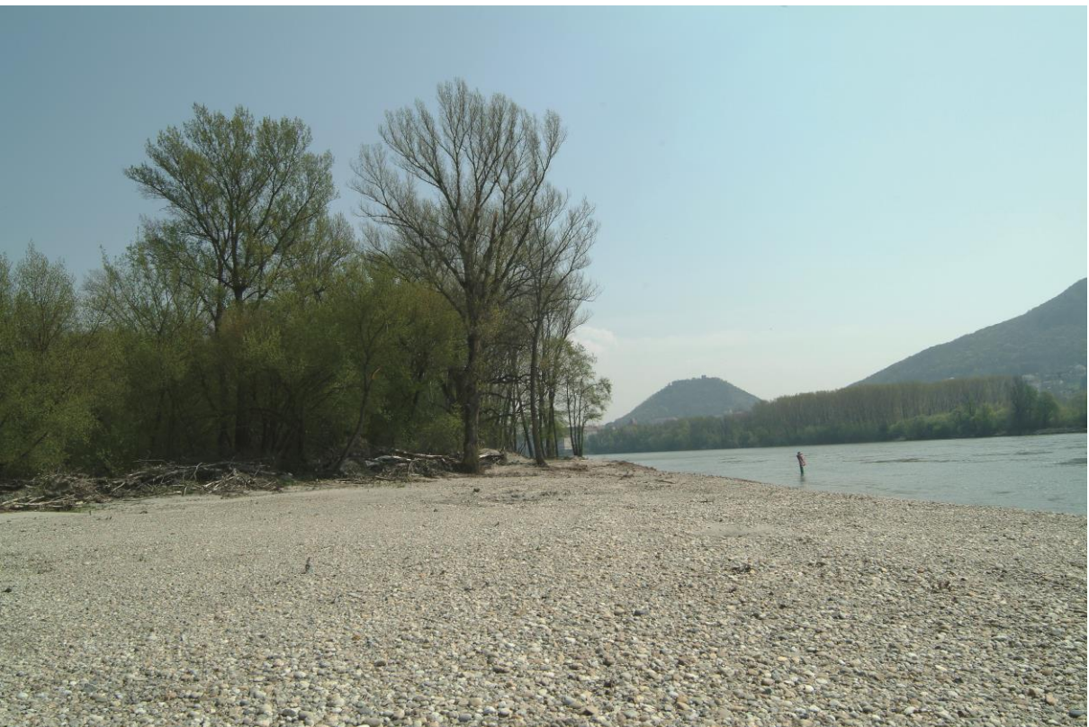
The restoration of the natural dynamics of a Danube floodplain to the east of Vienna was aimed at protecting riverine habitats and species but also at moderating floods and droughts. Photos show the floodplain before and after the hydrological restoration, which included the removal of all artificial elements to generate a natural river bank structure