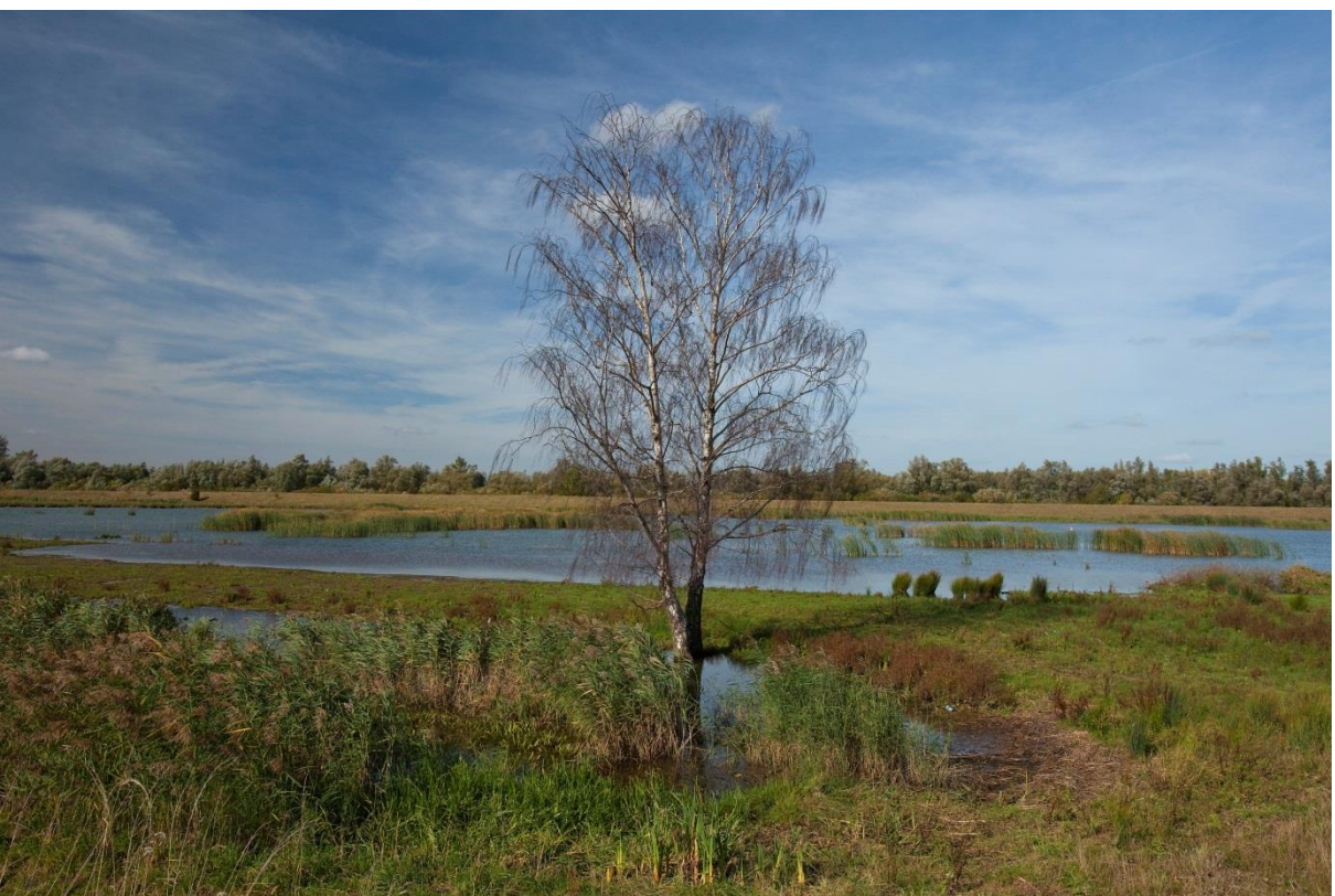
The restoration of the floodplain of the Noordwaard polder, the Netherlands, will provide climate change-related flood protection, improve the environmental quality for people and nature, increase recreational facilities and boost the economy. Both photos show the situation after depoldering, which has left more room for the river.