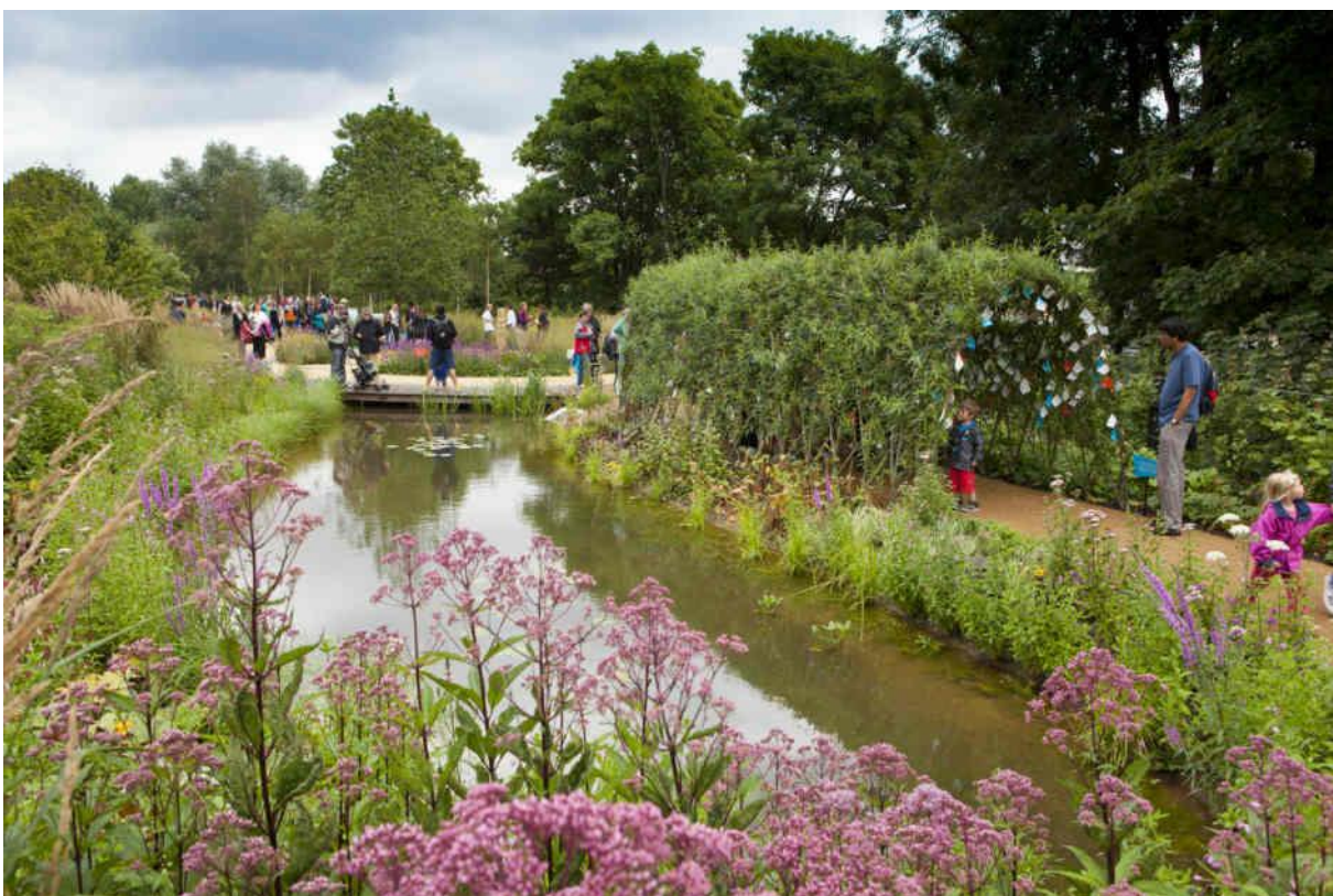
The Queen Elizabeth Olympic Park, located in East London and a formerly deprived area, has been at the heart of a major urban regeneration plan, in view of the 2012 Olympic Games. Photos show parts of the area before and after the regeneration.