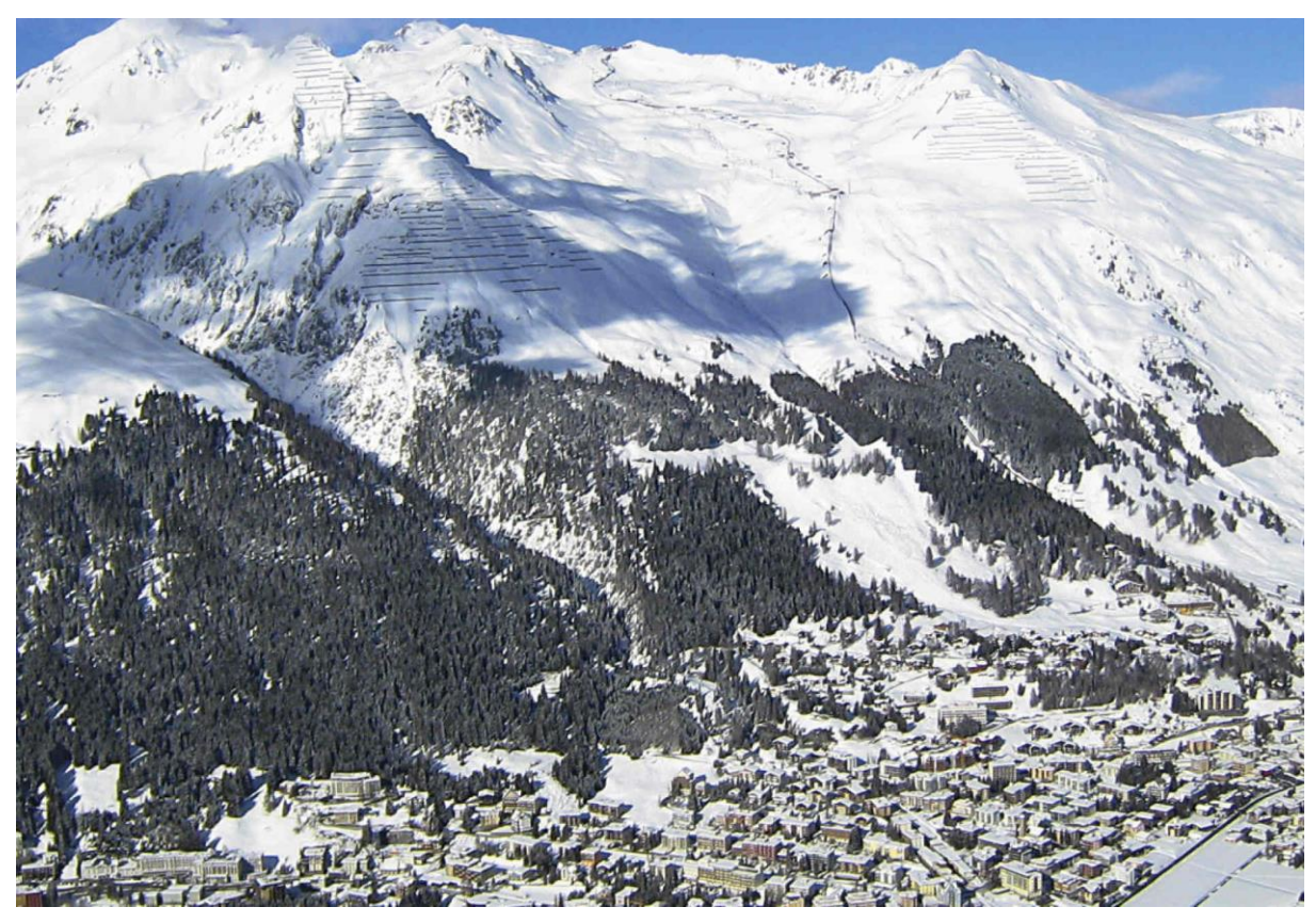
Improved protection against natural hazards, including avalanches, through intentional afforestation, adapted forest management (densification) and additional technical measures in Parsenn (Switzerland) between 1945 and 2007